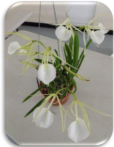
Species: B. nodosa gained 79 Points W&C Sewell