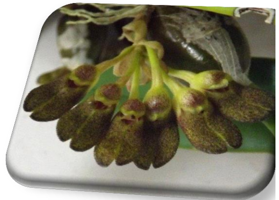
Specimen Plant: Bulb. spathulatum J & A Knowles