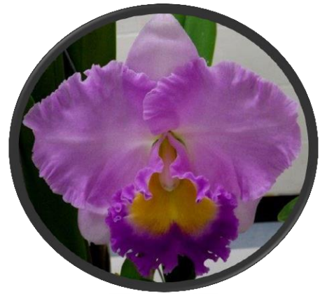
Hybrids: Rlc. Burdekin Pearl x Rlc. California Girl gained 82 Points C Truscott